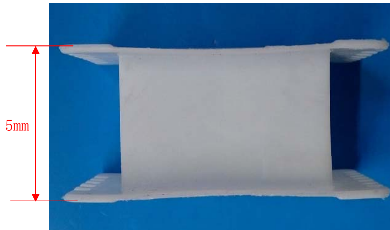
样品2 材质: PA66