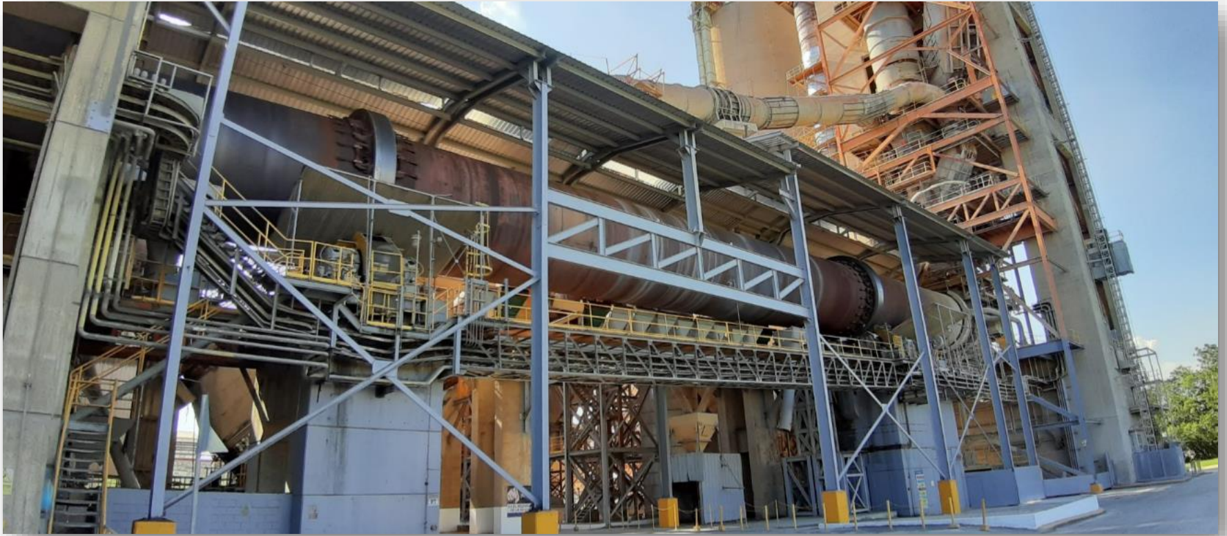
Kiln PL SPM